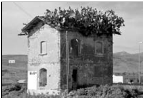
Country home in Sicily for sale