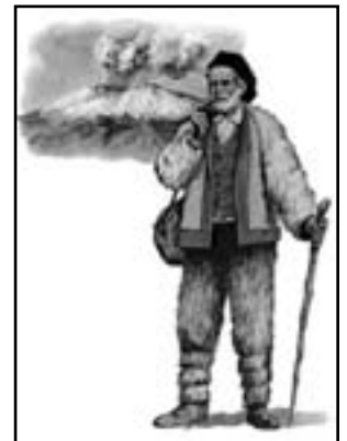
Costumi della Sicilia: Pastore dell 'Etna

Catania is the second largest city in Sicily, next to Palermo. It is on the east coast of the country, facing the Ionian Sea and lies at the foot of the active volcano Mount Etna. It is one of the main ports of Sicily and the city is known for many things, including being destroyed by a catastrophic earthquake in 1169. There was another earthquake in 1693 and several volcanic eruptions from Mount Etna. Although the volcanic activity has desolated parts of the land at times, and buried the city seven times in history, it has also produced a rich fertile soil, particularly good for agriculture, vineyards and orchards. Mount Etna is known as the largest active volcano in all of Europe. At 10,992 feet (which varies with summit eruptions), it is the highest mountain in Italy, south of the Alps and by the far the largest of three active volcanoes in the country. Mount Etna, "beautiful mountain" in Latin is almost in a constant state of activity. The first volcanic activity took place a half a million years ago and