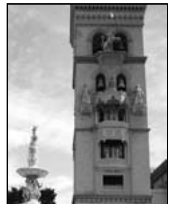
Messina's mechanical clock

Messina is the third largest city on the island of Sicily. Located on the northeast side of Sicily, at the strait of Messina, the port is a main economical resource for business and military. It is also believed to be the harbor where the Black Death entered Europe, brought by ships coming into port. The city reached its peak of splendor in the 17th century, under Spanish domination, and was considered one of the greatest cities in Europe. In the late 1600's the city rebelled to gain independence, which it enjoyed for some time before being reconquered by the Spaniards. A