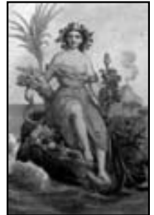
Above: An allegorical figure representing Sicily. Left: The monument at Naxos commemorating the arrival of the Greeks in Sicily..

Finally after years of Greek control, Syracuse falls to the Romans and due to a misunderstanding the brilliant Greek scientist, Archimedes is killed. (Check with Google to recall his tragic death). Now we arrive into the AD times, do you remember what AD translates as? (In fact, most politically correct "people" use the CE)...Do you agree with that or not? Let me know your thoughts!