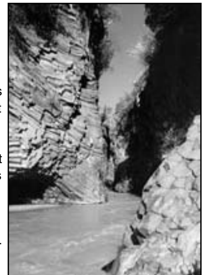
Etna's Alcantara Gorge