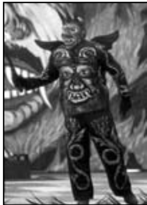
Devils are the main characters in the Easter celebration at Adrano in Catania

the most recent was in January of this year. The mountain doesn't always erupt in the same place. The most explosive eruptions happen at the summit, but eruptions have also occurred on the ground level and on the sides of the mountain. The longest eruption began in 1991 and lasted more than a year. The most unusual eruption occurred in the early 1970s when the mountain erupted smoke rings. Catania has always been one of Italy's most important and flourishing cultural, artistic, and political centers. It is also the site of the first university in Sicily, which opened in 1434. Today, Catania is one of the main economic, tourist, technological, and educational centers on the island. The symbol of the city, Fontana dell'Elefante, was crafted by artist Giovanni Battista Vaccarini in 1736. It portrays an ancient lava stone elephant topped with a stone obelisk from ancient Egypt.