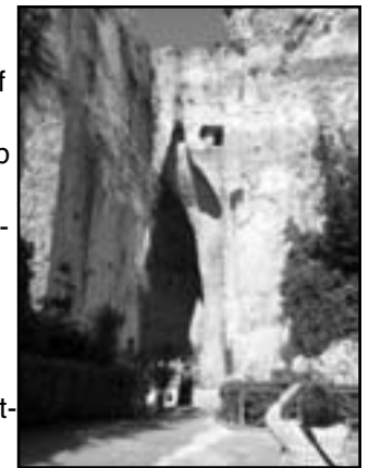
Ear of Dionysius