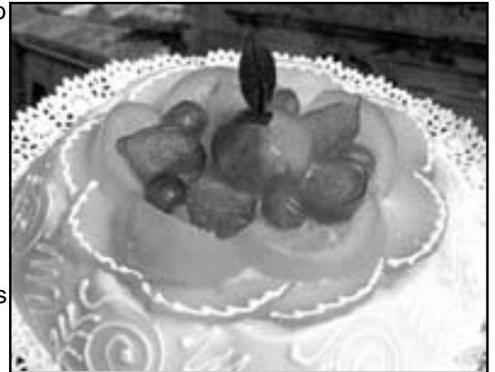
Noto's Classic Candy

is famous for its 18th century buildings. The town hall houses neo-classical style frescoes by Antonio Mazza. Noto is very famous for its almond, called pizzuto, and also for